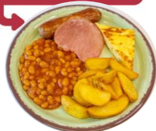
Brunch: Sausage G.SU. Omelette D.E.