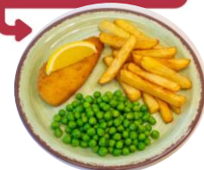
Breaded Fish Fillet F.