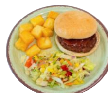
(vg) Plant Power Burger in a Bun G.