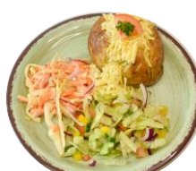
(v) Cheese D.