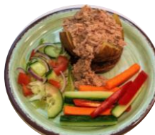
Tuna Mayonnaise F.E.