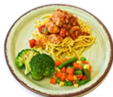
(v) Sweet and Sour Quorn G.E.