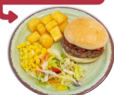
Beef Grill G. in a Bun G.