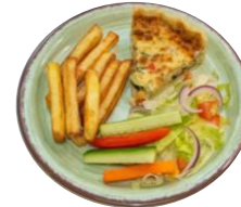
(v) Roasted Vegetable Tart G.D.E.