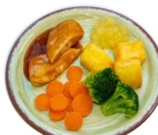
(vg) Quorn Roast G. Apple Sauce