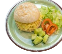
(v) Cheddar Cheese G.D.