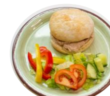
Tuna Mayonnaise F.E.