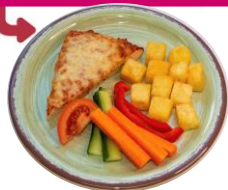
Cheese and Tomato Pizza D.G.