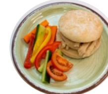
British Roast Chicken G.