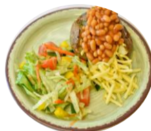
(v) Cheese/Beans D.