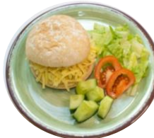
(v) Cheddar Cheese G.D.