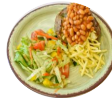
(v) Cheese/Beans D.