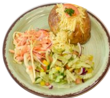
(v) Cheese D.