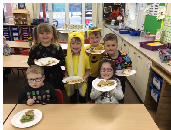
Hedgehog class enjoying their sandwiches they made for a picnic with Pudsey.