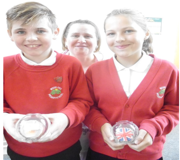
Our Cake Decorating Workshop led by FOWES and