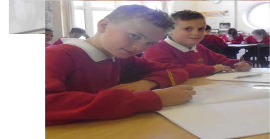
Year 6 preparation for KS2 SATs-self assessing Reasoning skills in Mathematics.