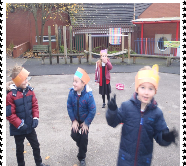
Beech Class acting out 'The Gingerbread Man'