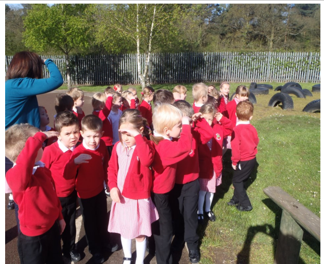
Beech class find dinosaur footprints in school playground!