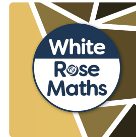
Y1 WRM - Spring