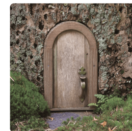
The Enchanted Woodland