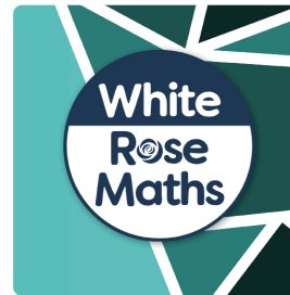
Y1 WRM - Autumn