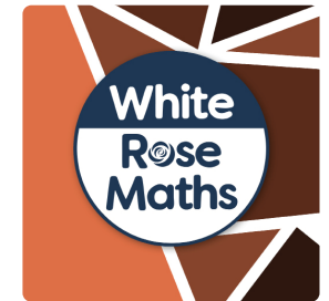
Y1 WRM - Summer