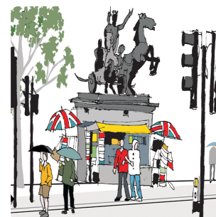
Bright Lights, Big City