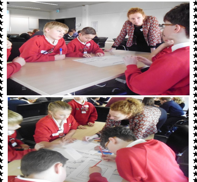
A small group of year 6 pupils visited IBM to develop their enterprise skills.