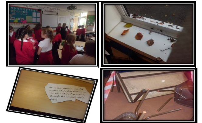
Oak class was ransacked by a mystery person overnight. The children collected evidence and found out it was Burglar Bill.